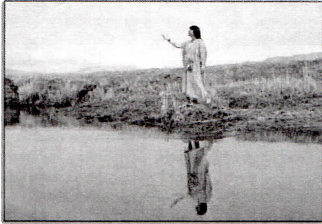
Sarah Winnemucca Hopkins